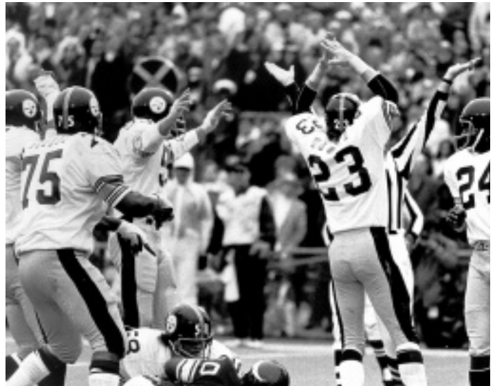
The Steelers celebrate their safety against Vikings' quarterback Fran Tarkenton in Super Bowl IX.

RECEIVING: Pit. - Brown 3-49, 1 TD; Stallworth 3-24; Bleier 2-11; Lewis 1-12. Min. - Foreman 5-50; Voigt 2-31; Osborn 2-7; Gilliam 1-16; Reed 1-(-2-9).