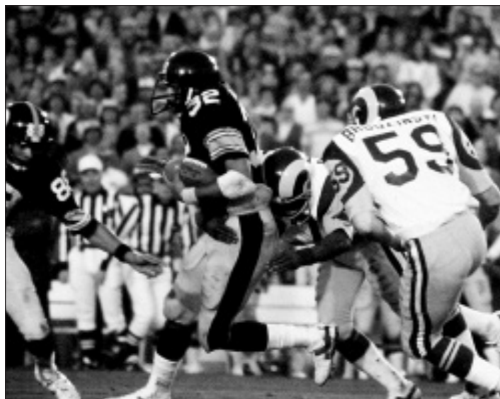
Steelers' running back Franco Harris ran for two touchdowns, including the game's final score, as Pittsburgh recorded a 31-19 win over the Los Angeles Rams in Super Bowl XIV.