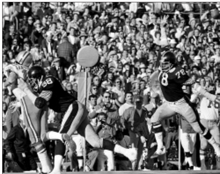
Pittsburgh's "Steel Curtain" defense forced Cowboys' quarterback Roger Staubach into throwing three interceptions in the Steelers' Super Bowl X victory.

RECEIVING: Dal. - P. Pearson 5-53; Young 3-31, 1 TD; D. Pearson 2-59, 1 TD; Newhouse 2-12; Howard 1-34, 1 TD; Fugett 1-9; Dennison 1-6. Pit. - Swann 4-161, 1 TD; Stallworth 2-8; Harris 1-26; Grossman 1-7, 1 TD; Brown 1-7.