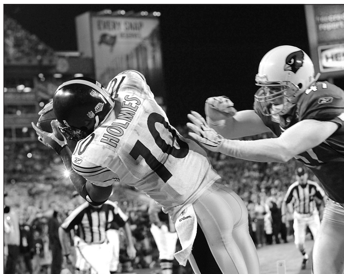
WR Santonio Holmes catches the game-winning six-yard touchdown pass from QB Ben Roethlisberger to seal the Steelers' victory in Super Bowl XLIII.

RECEIVING: Pit. — Holmes 9-131, 1 TD; Miller 5-57; Ward 2-43; Washington 1-11; Davis 1-6; Spaeth 1-6; Moore 1-4; Parker 1-(-2). Ari. — Boldin 8-84; Fitzgerald 7-127, 2 TDs; Breaston 6-71; James 4-28; Arrington 2-35; Hightower 2-13; Urban 1-18; Patrick 1-1, 1 TD.