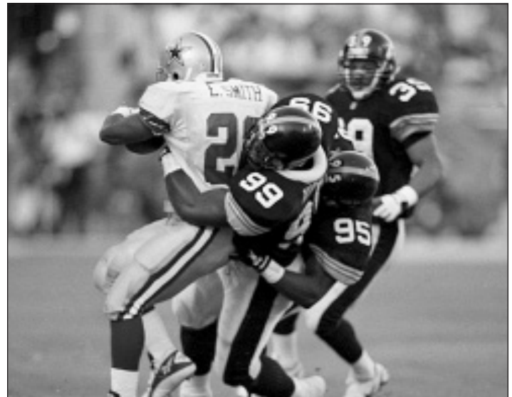
Pittsburgh's defense limited Dallas to just 56 rushing yards in their Super Bowl XXX matchup.