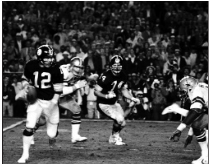
Steeler's quarterback Terry Bradshaw threw for 318 yards and four touchdowns in the 35-31 victory over Dallas in Super Bowl XIII.

RECEIVING: Pit. - Swann 7-154, 1 TD; Stallworth 3-115, 2 TDs; Grossman 3-29; Harris 1-22; Bleier 1-7, 1 TD; Bell 2-21. Dal. - Dorsett 5-44; D. Pearson 4-73; Hill 2-49, 1 TD; Johnson 2-30, 1 TD; Dupree 2-17, 1 TD; P. Pearson 2-15.